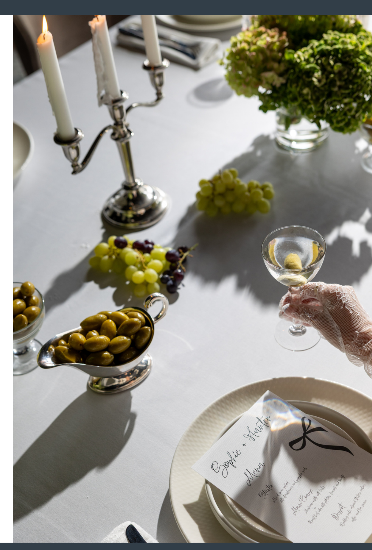
ELOPEMENTS & MICROWEDDINGS Married in a Martini Minute package