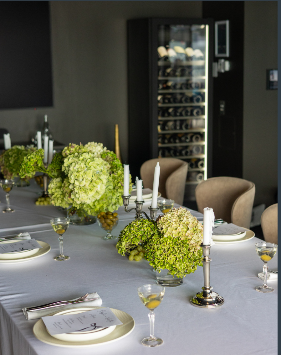
CAPACITY: Terrace Seated - 28